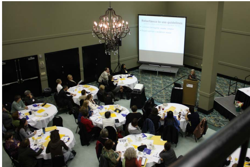
2010 Pain Conference, Moose Jaw Saskatchewan

In addition to the above activities, an Interprofessional Education conference in Pain Management was held in January 2011, in Regina. The one-and-a-half day conference attracted 120 students and faculty from the University of Regina and University of Saskatchewan. Students from the fields of psychology, social work, kinesiology, health studies, physiotherapy, pharmacy, medicine and nursing participated in lectures and case based discussions on a variety of pain-related topics. Students reported that the highlight of the conference was the client panel and the interprofessional collaboration that transpired in the small-group case discussions. It is anticipated that this experience will become an annual activity in an effort to improve interprofessional practice in pain management within our region.