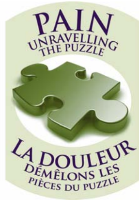
EXHIBIT AND SPONSOR SUPPORT GUIDE 2006

Canadian Pain Society Société canadienne de la douleur Annual Conference June 14–17, 2006 Congrès Annuel 14–17 juin 2006